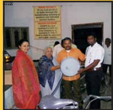
Distribution of ministry tools: drums