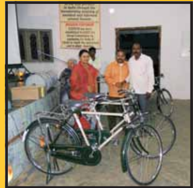
Distribution of ministry tools: bicycles