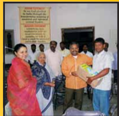
Distribution of ministry tools: lanterns