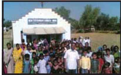
Build a Native Church $10,000* (*price varies according to location)