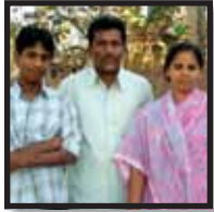
Pastor (City) $100/month