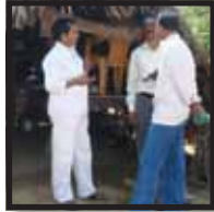
Pastor (Village or Town) $50/month