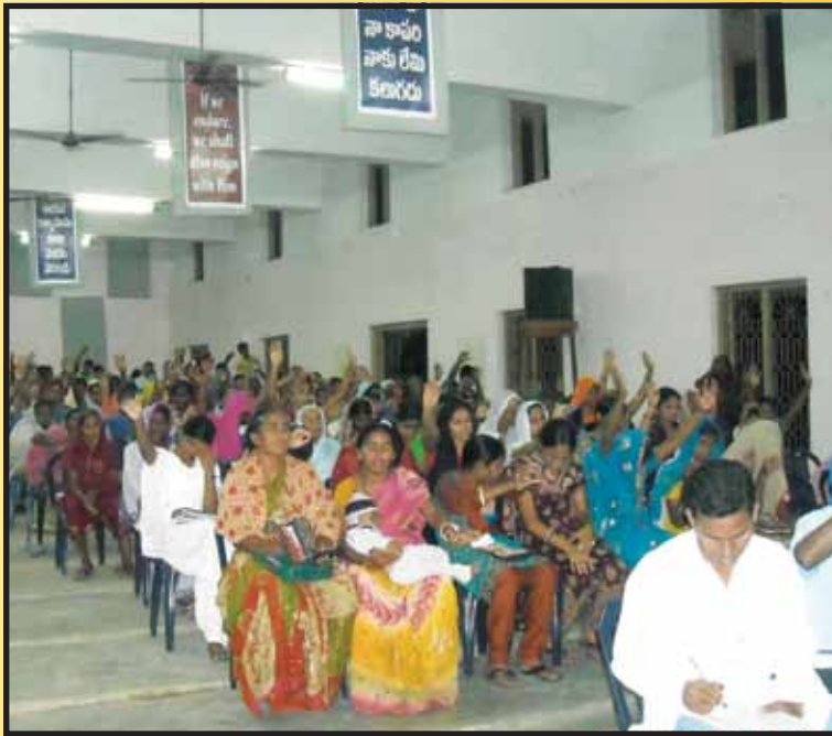
Delegates to the Pastor's Conference.

A time of refreshing, encouragement, fellowship, equipping and being energized for the field.