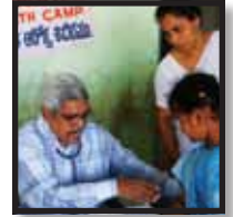
Doctor (MD) $400/month