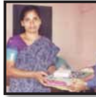
Teacher (Village School) $50/month