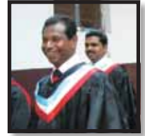
Faculty (Seminary) $150/month