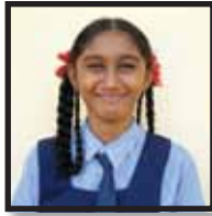
Child (NJ School) $40/month