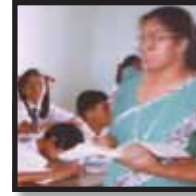
Teacher (Grammar, HS) $100/month