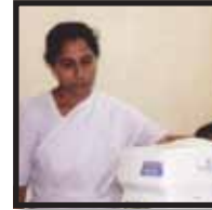
Nurse (Medical) $50/month