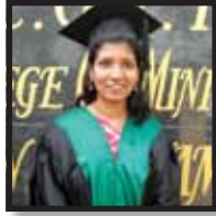
Student (Seminary) $50/month