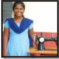
Student (Women's College) $50/month